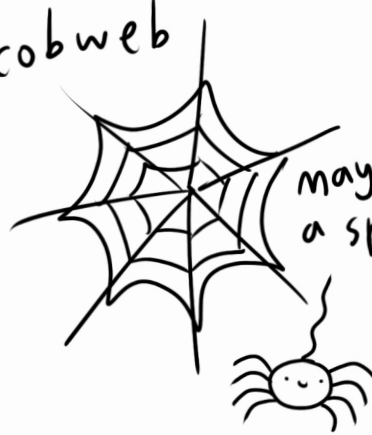
maybe a spider!