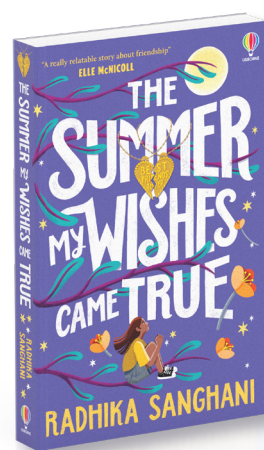
The Summer My Wishes Came True 9781805318293