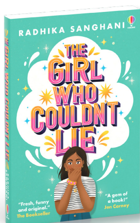
The Girl Who Couldn't Lie 9781805316749