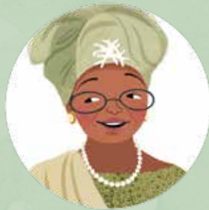
ELLEN JOHNSON SIRLEAF Former President of Liberia and Nobel Peace Prize winner