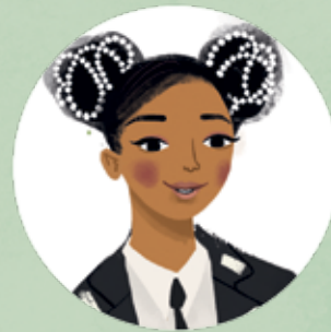
JANELLE MONÁE Singer and actor