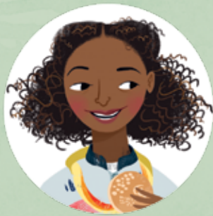
KADEENA COX Para athlete