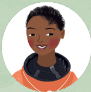
MAE JEMISON Scientist and astronaut