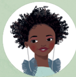
LUPITA NYONG'O Actor