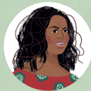
MICHELLE OBAMA Lawyer, author and former First Lady of the USA