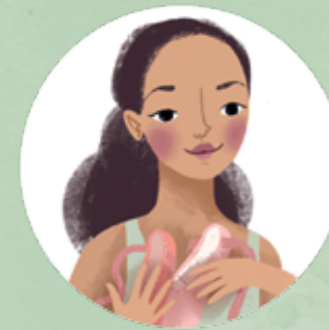
MISTY COPELAND Ballet dancer