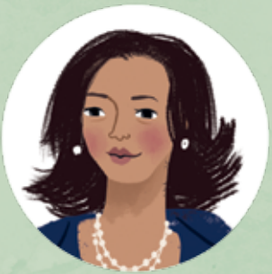
KAMALA HARRIS Vice President of the USA