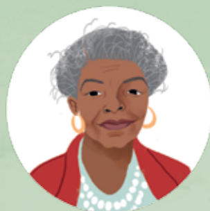
MAYA ANGELOU Author and human rights activist