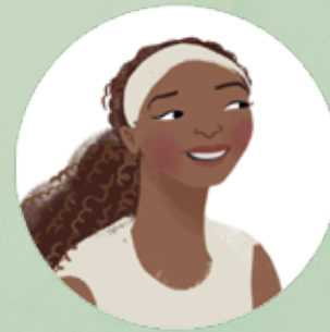
SERENA WILLIAMS Tennis player