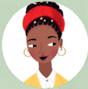
AMANDA GORMAN Poet and activist