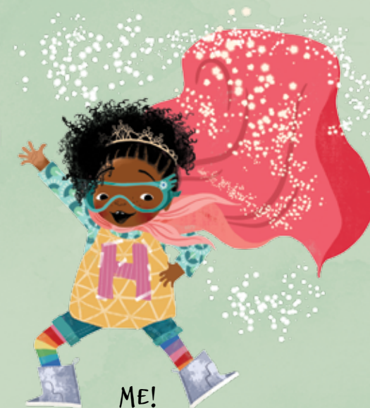
ME! Superhero princess