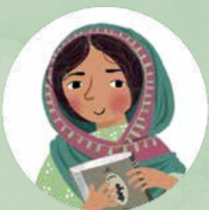
MALALA YOUSAFZAI Human rights activist