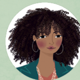
YARA SHAHIDI Actor