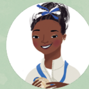
SIMONE BILES Gymnast