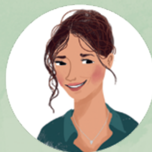
MEGHAN MARKLE Actor and Duchess of Sussex