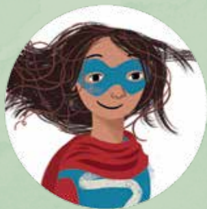
KAMALA KHAN Superhero