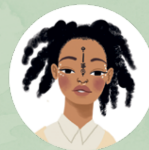
WILLOW SMITH Singer and actor