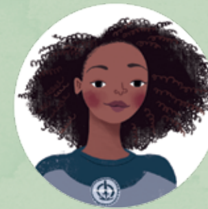
MONICA RAMBEAU Superhero